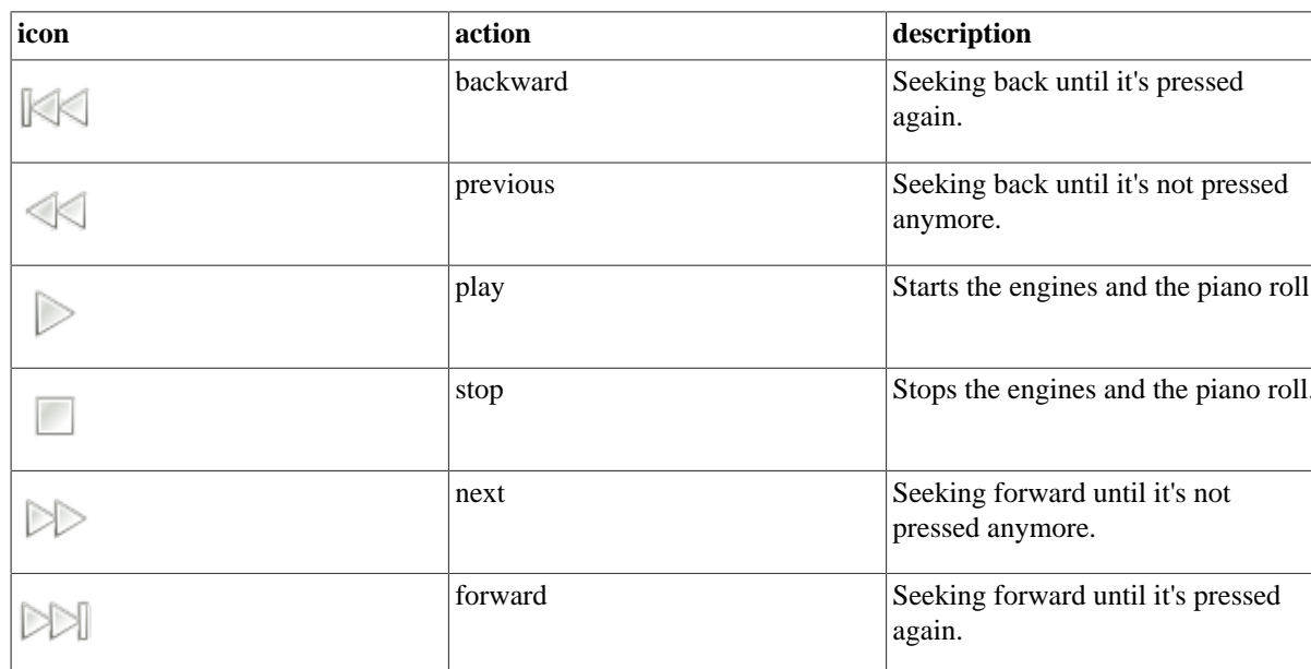
Table 4.1. AGS playback controls table

The loop checkbox enables the loop L and loop R settings below. It causes the notation to loop playback. Auto-Scroll checkbox animates the horizontal scrollbars to follow playback position. Use exclude sequencers checkbox to enable/disable pattern based sequencers.